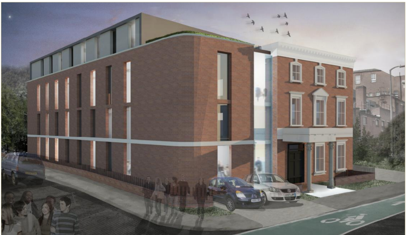
Approved student accommodation scheme for the extensions and redevelopment of 2 Chesnut Road (Ref: HGY/2013/0155)