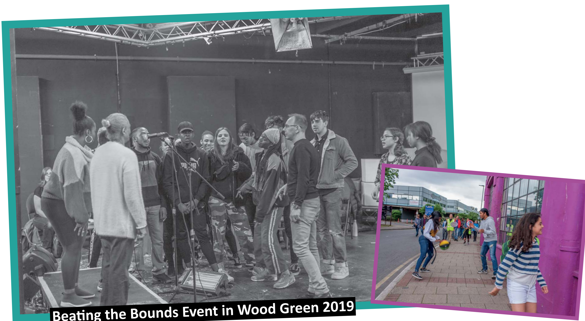
Beating the Bounds Event in Wood Green 2019