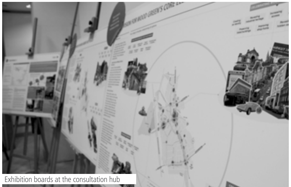
Exhibition boards at the consultation hub

The public exhibition comprised 4 parts: 1. Wood Green and the regeneration plan 2. Common goals completed by the findings to date 3. Broad options for a long-term plan 4. Ideas for short-term projects