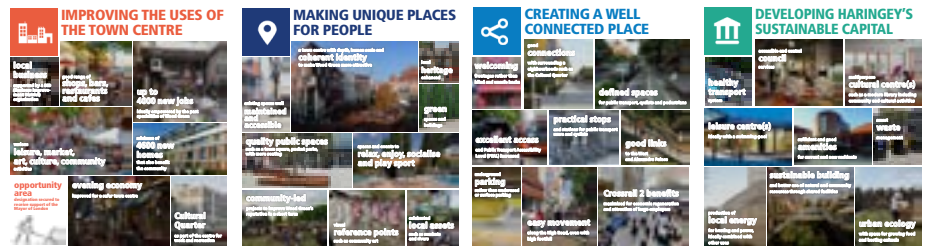
Sample of the goals board

Please find more detail about these elements in the appendices.