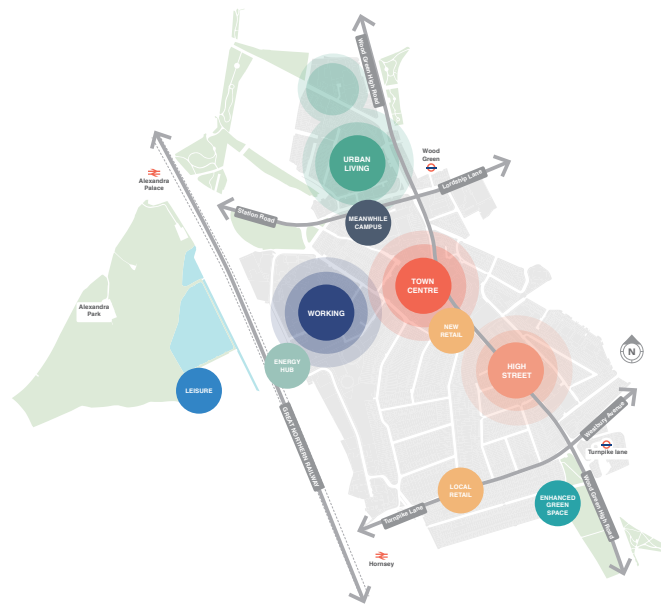
Sample of the vision for Wood Green's key places board