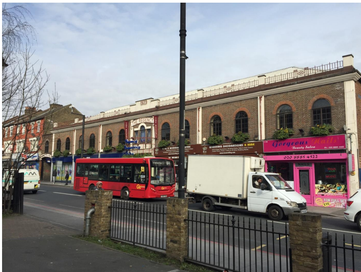
Fig 1 The front elevation of the building facing Bruce Grove.