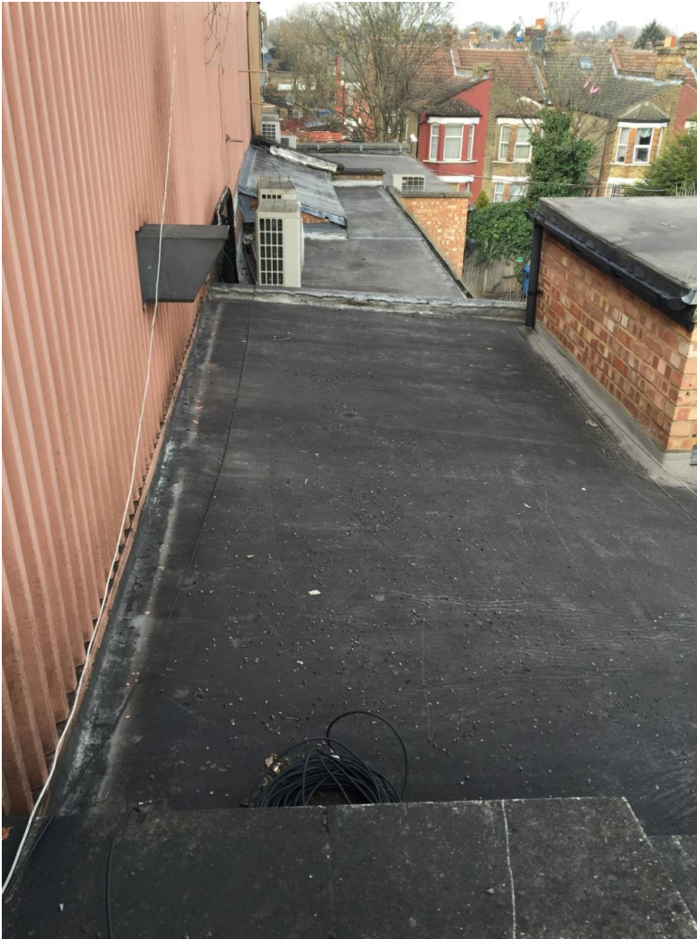
Fig 6 View over the asphalt roofs of the rear additions to the building.

3.8 Located to the rear of the building is a large carpark covering the remainder of the site. This is an unattractive asphalt paved space which detracts from the setting of the building, albeit that the rear elevation is also extremely poor. To the south of the site are the side and rear elevations of the former Bruce Grove cinema. It is acknowledged that these reflect the original functionality of the building however the blank brick facades are of no architectural or aesthetic merit and combine with the low quality rear elevation of the Regency Banqueting Suite to create a negative feature that detracts from the character and appearance of the conservation area.