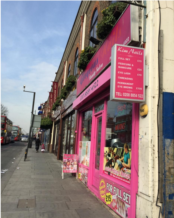
Fig 2 The ground floor shopfronts.

brickwork and later 20 th century extensions and modifications. A large blank metal clad box is located at 1 st floor level and beneath this are an uncoordinated series of additions, constructed in Fletton brick and with a number of PVCu windows. At the southern end is a utilitarian fire escape running beneath the 1 st floor projection which is supported on concrete columns. The refuse area and other back of house functions contribute to the utilitarian nature of the rear elevation.