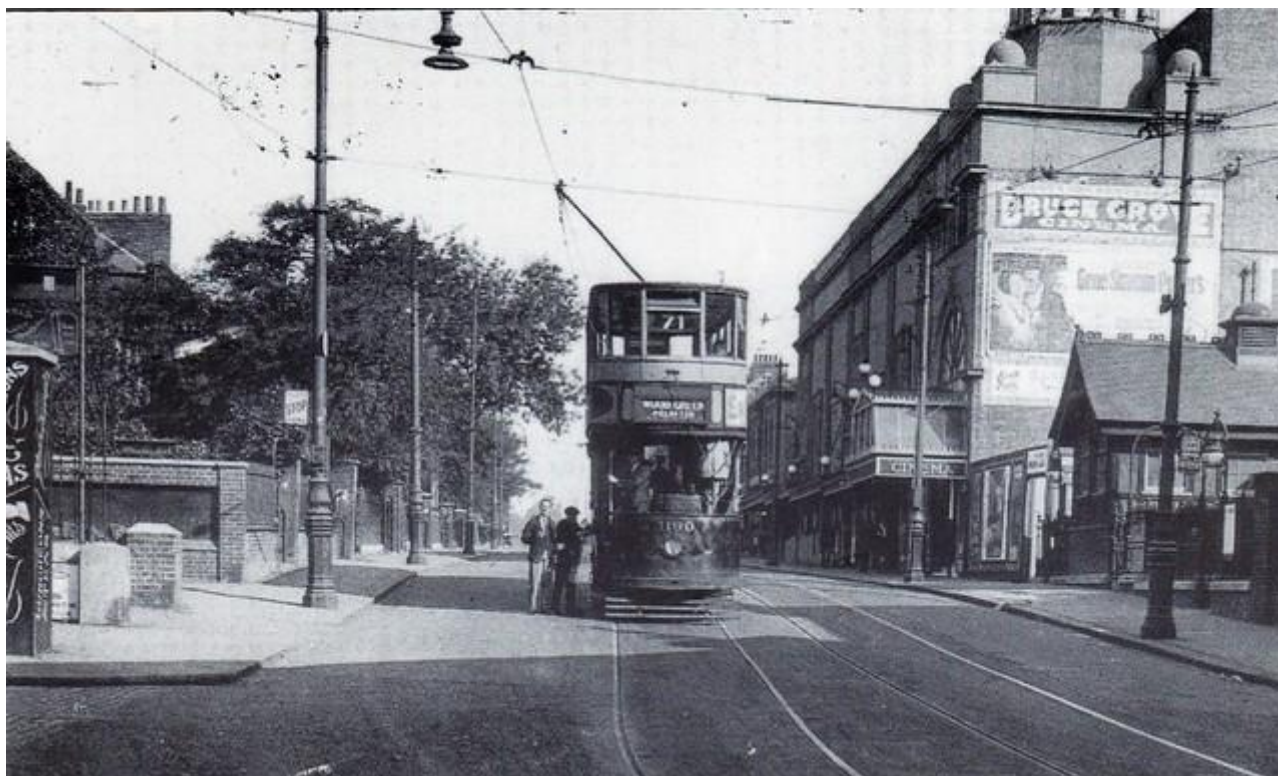
Fig 8 Historic photograph looking north along Bruce Grove with the former cinema in the foreground and the Regency Banqueting suite beyond.