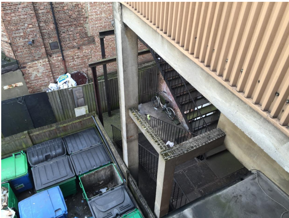
Fig 5 Fire escape and refuse area to the rear of the building.