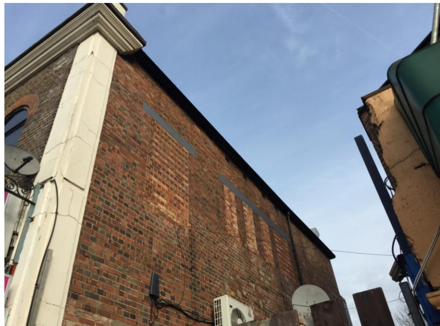
Fig 3 Southern flank elevation.