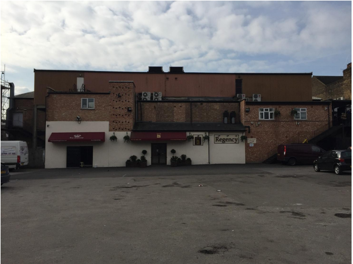
Fig 4 The rear elevation of the building viewed from the carpark.