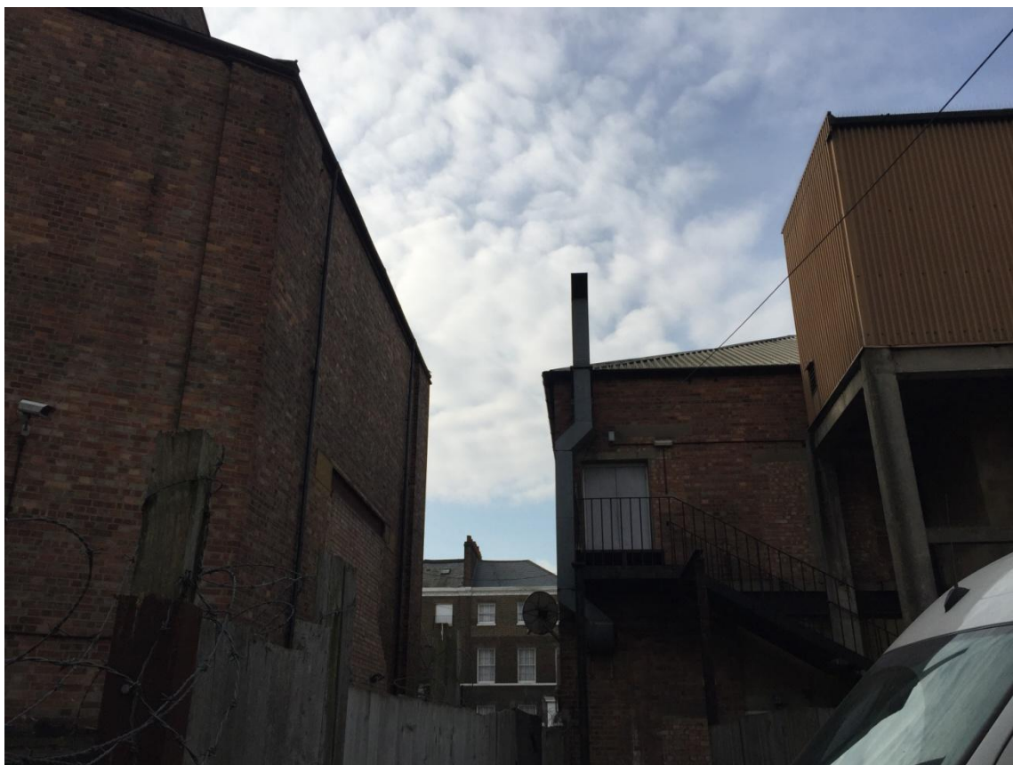
Fig 7 The rear of the building and the adjacent blank facades of the former cinema.

former ballroom retains small amounts of original cornicing but has also been fully overhauled and altered.