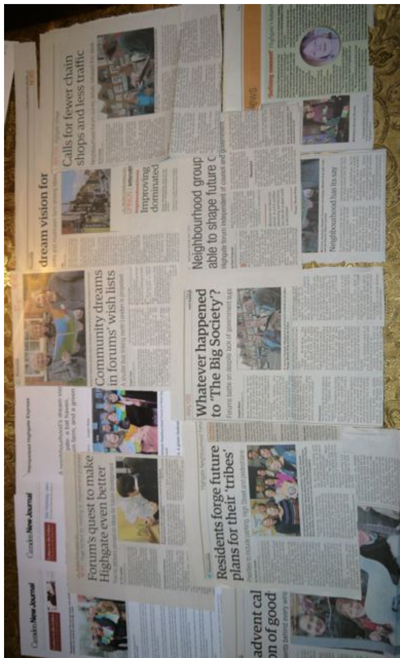
Fig 1: Articles in the Camden New Journal and Ham and High

In addition to regular articles in the Highgate Society's well-read Buzz magazine, the Forum has been very successful in gaining coverage in our two local papers – Camden New Journal and The Ham and High .