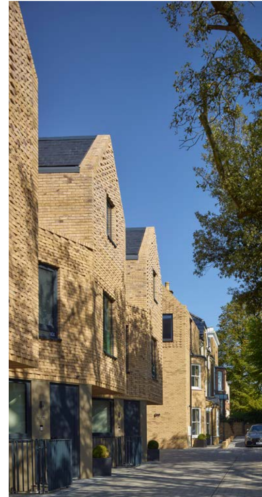
Beacon Lodge © pH+ Architects

https://www.london.gov.uk/sites/default/files/ggbd_london_design_review_charter_jan22.pdf