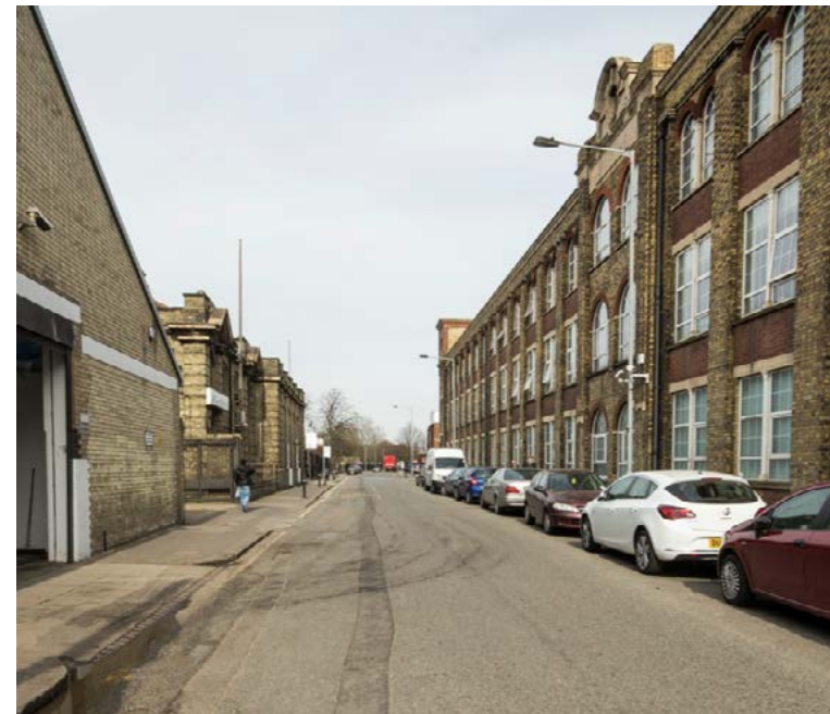
Ashley Road South

As a public authority, the London Borough of Haringey is subject to the Freedom of Information Act 2000 (the Act). All requests made to Haringey Council for information with regard to the Quality Review Panel will be handled according to the provisions of the Act. Legal advice may be required on a case by case basis to establish whether any exemptions apply under the Act.