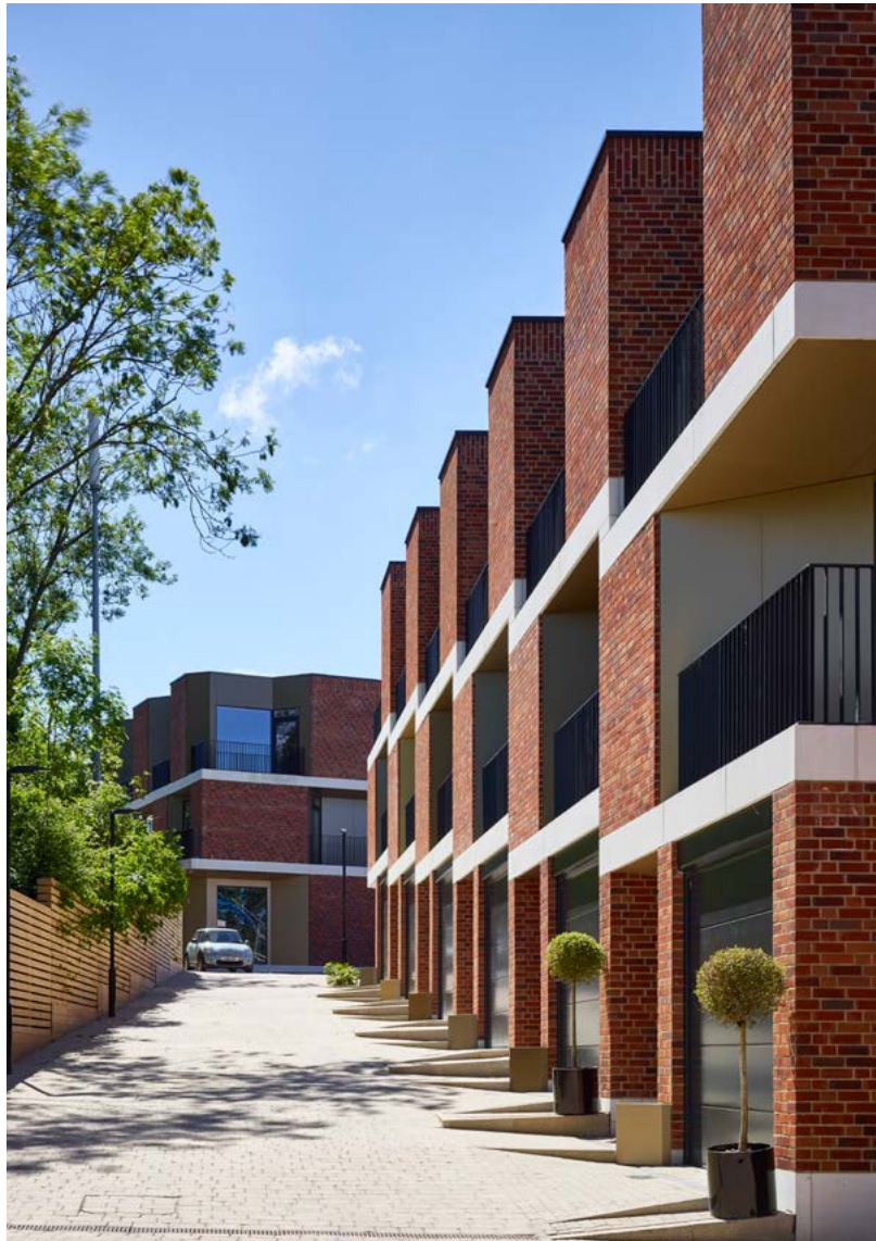
Pinnacle, pH+ Architects Haringey Design Award 2018 - Best Residential