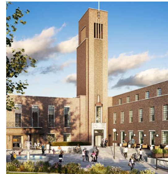
Hornsey Town Hall, Make Architects

By offering advice to applicants during the pre-application process and by commenting on planning applications, the Quality Review Panel supports Haringey's planning officers and planning committee in securing high quality development.