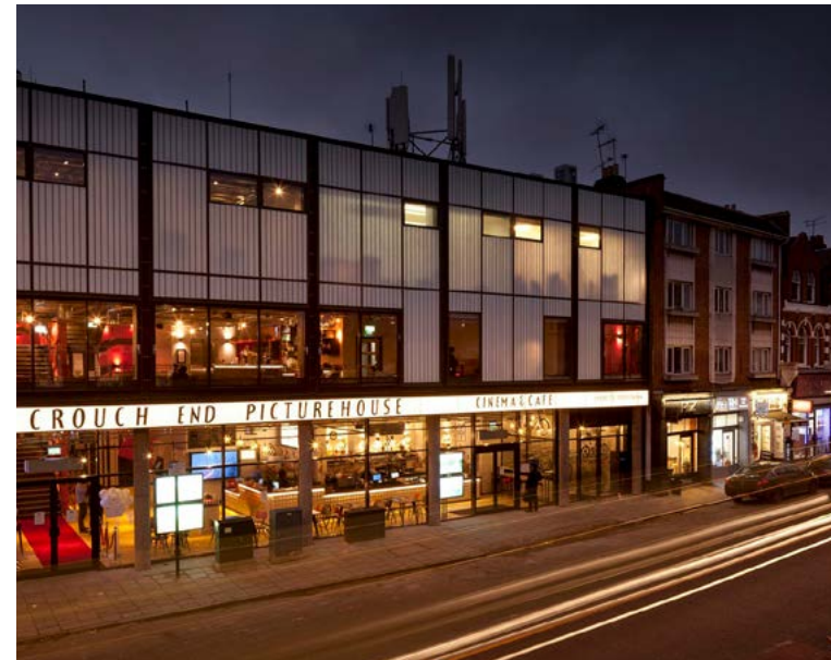
Crouch End Picture House, Panter Hudspith Architects Haringey Design Award 2016 - Best Green Design

As part of this annual review process, a meeting will be held with key Haringey Council officers and the panel chair to discuss the report and consider any recommendations for the following year.