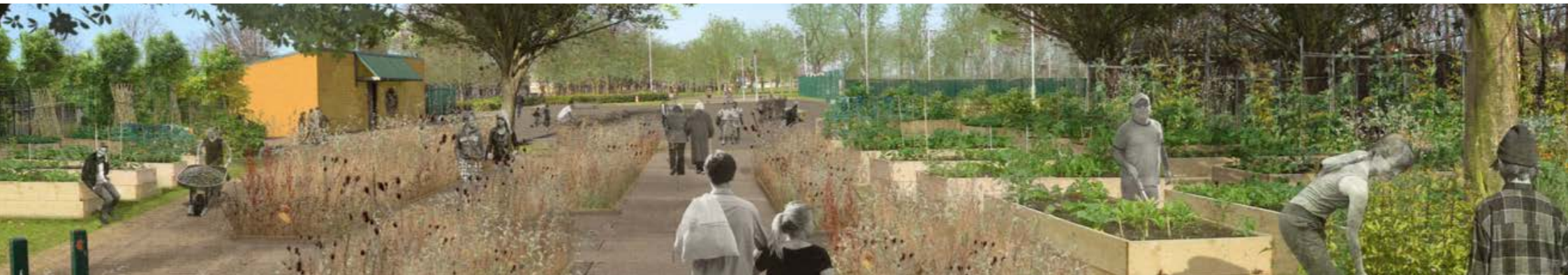
Tottenham Hale Green Grid, view of Down Lane by Kinnear Landscape Architects for Haringey Council Haringey Design Awards 2018 - Best conceptual project

Design Review: Principles and Practice Design Council CABE / Landscape Institute / RTPi / RIBA (2013)