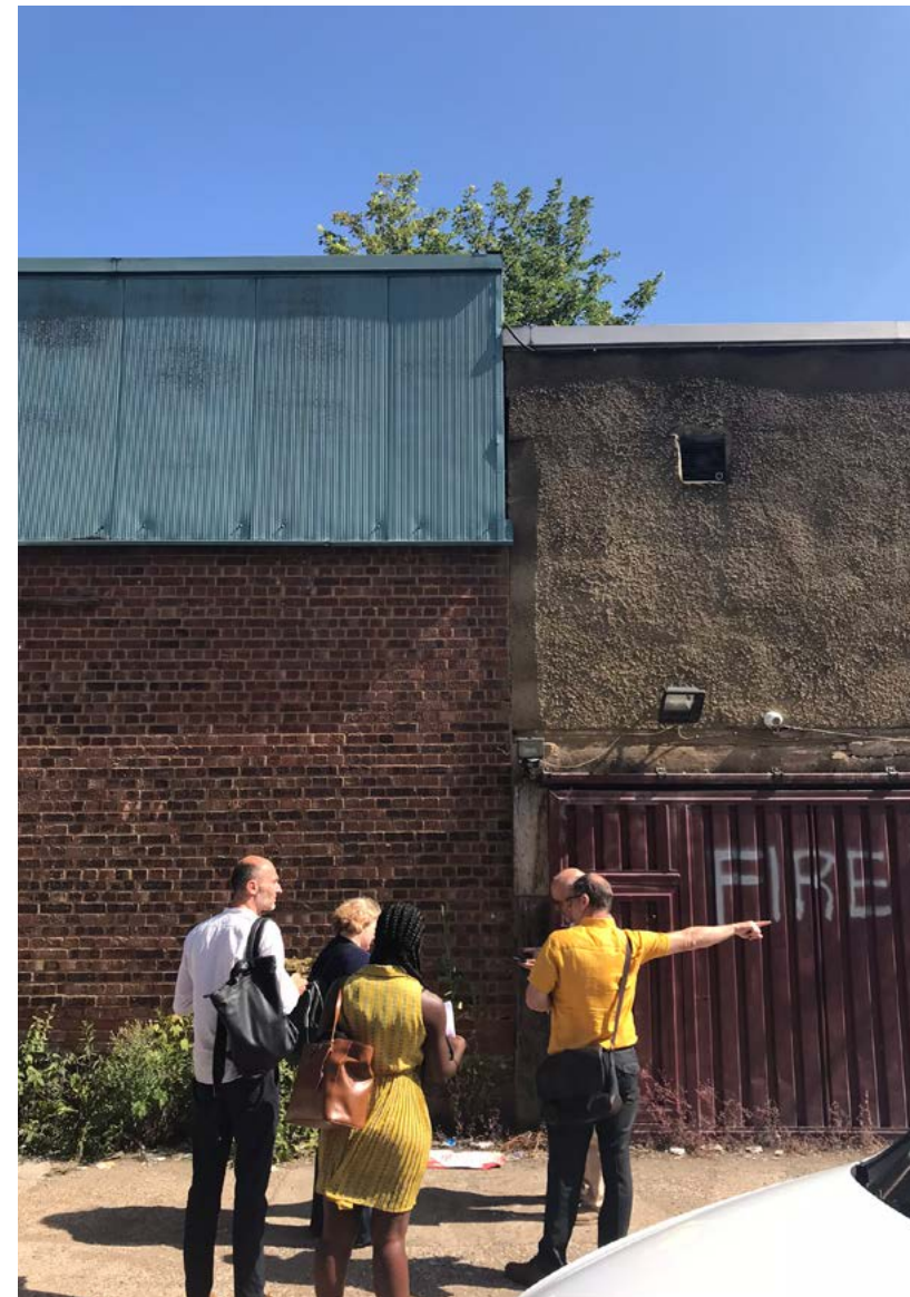
Haringey Quality Review Panel site visit

From time to time, it may be of benefit for specialist advice to be provided beyond the Quality Review Panel membership. In such cases, a professional with the relevant expertise may be invited to attend a review meeting, participating in the discussion with the status of an adviser to the panel.