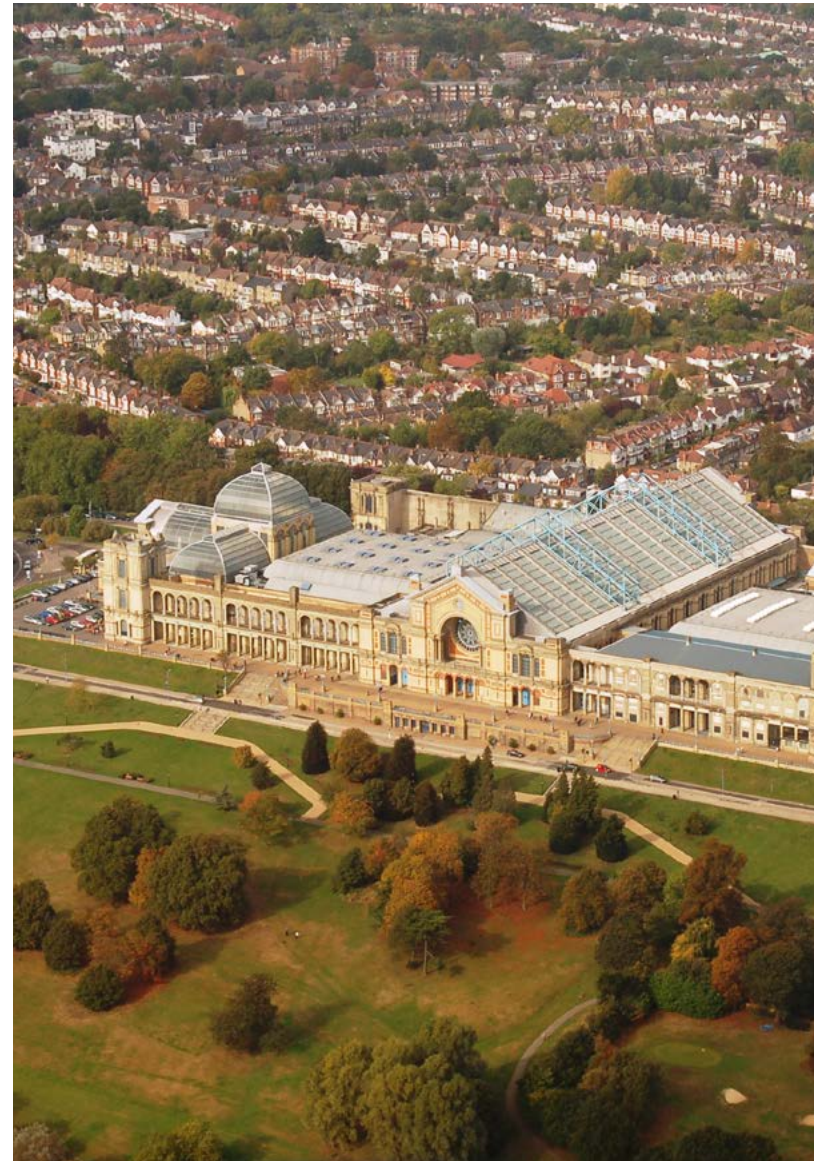
Aerial view of Alexandra Palace