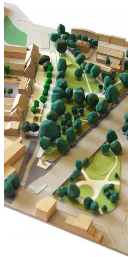
Tottenham Green, Adams & Sutherland for Haringey Council Haringey Design Award 2016 - Best Place or Landscape

A surgery review will be summarised in a brief document no more than two sides of A4, rather than a full report.