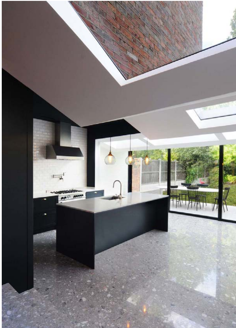
Folds House, Bureau de Change Architects, Haringey Design Award 2016 - Best House / British Homes Award 2016 - One-off House or Extension