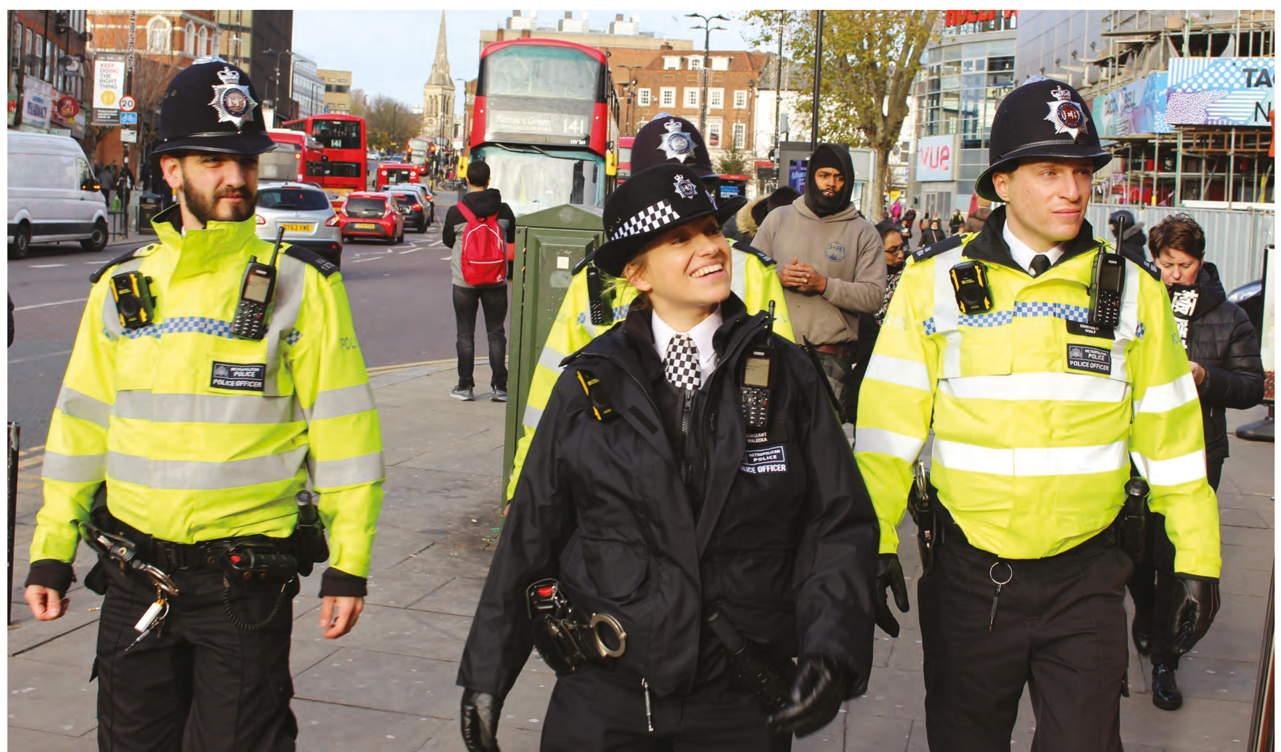
The town centre police team undertaking a patrol of the Wood Green town centre area. Haringey Council has continued to work closely with the police as part of the 'Partner Problem Solving Group' which brings together council departments and partner agencies to combine their knowledge, resources and authorities to address persistent problems.