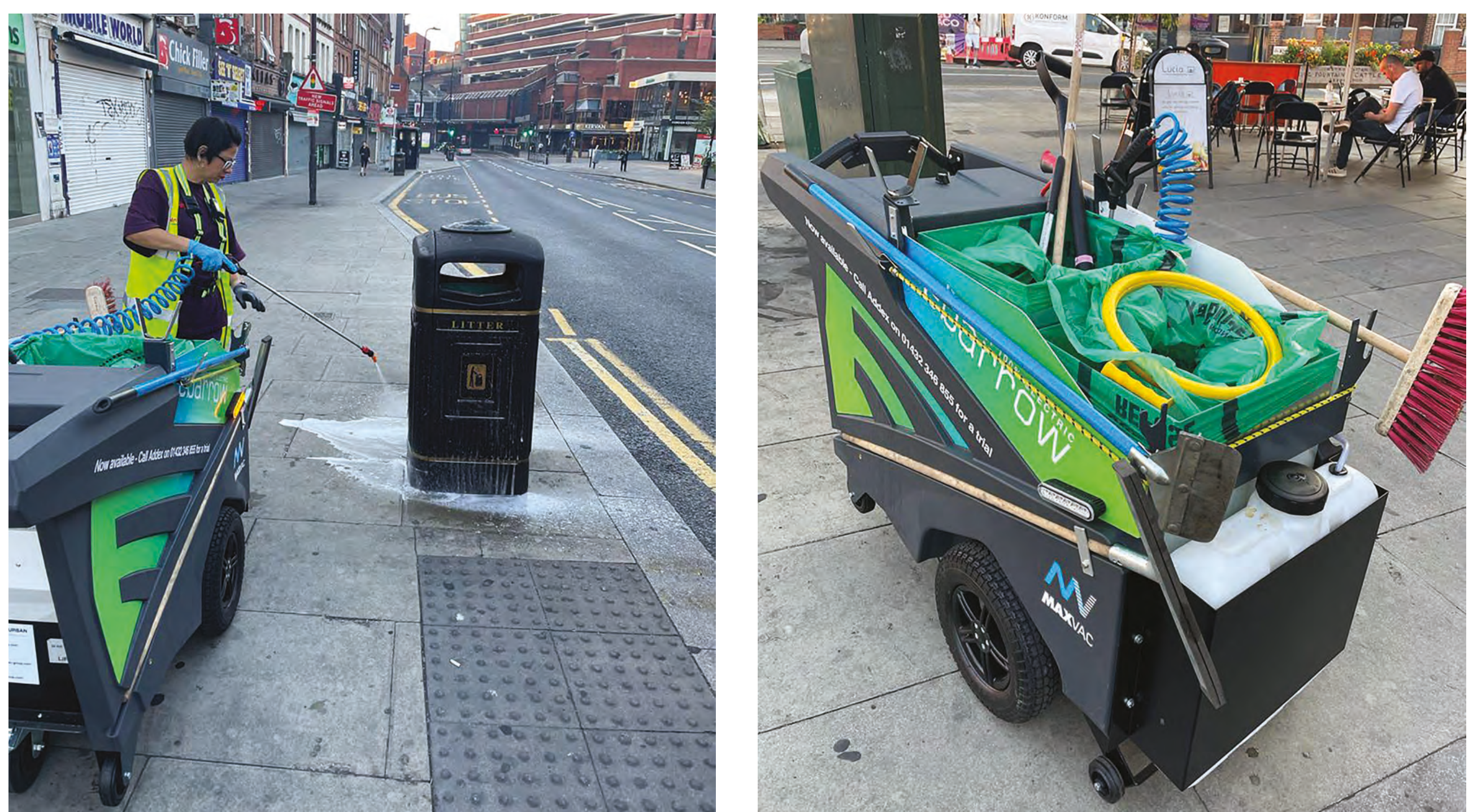
Cleansing staff washing down all litter bins and surrounds on Wood Green High Road in spring.