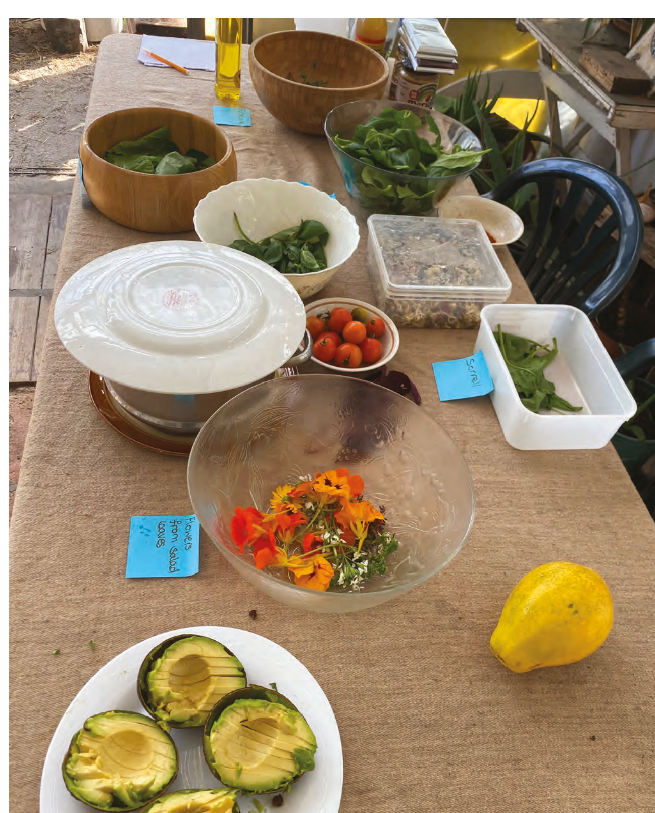
Local Social Prescribing providers were brought together by The Ubele Initiative to collaborate on the delivery of programme of sessions using green skills to enhance wellbeing. Black Rootz, led on "Growing Together" which took place on Tuesdays 12-4pm and included a hot vegan lunch, growing plants, alongside emotional and physical wellbeing activities using art and healthy meal preparation.