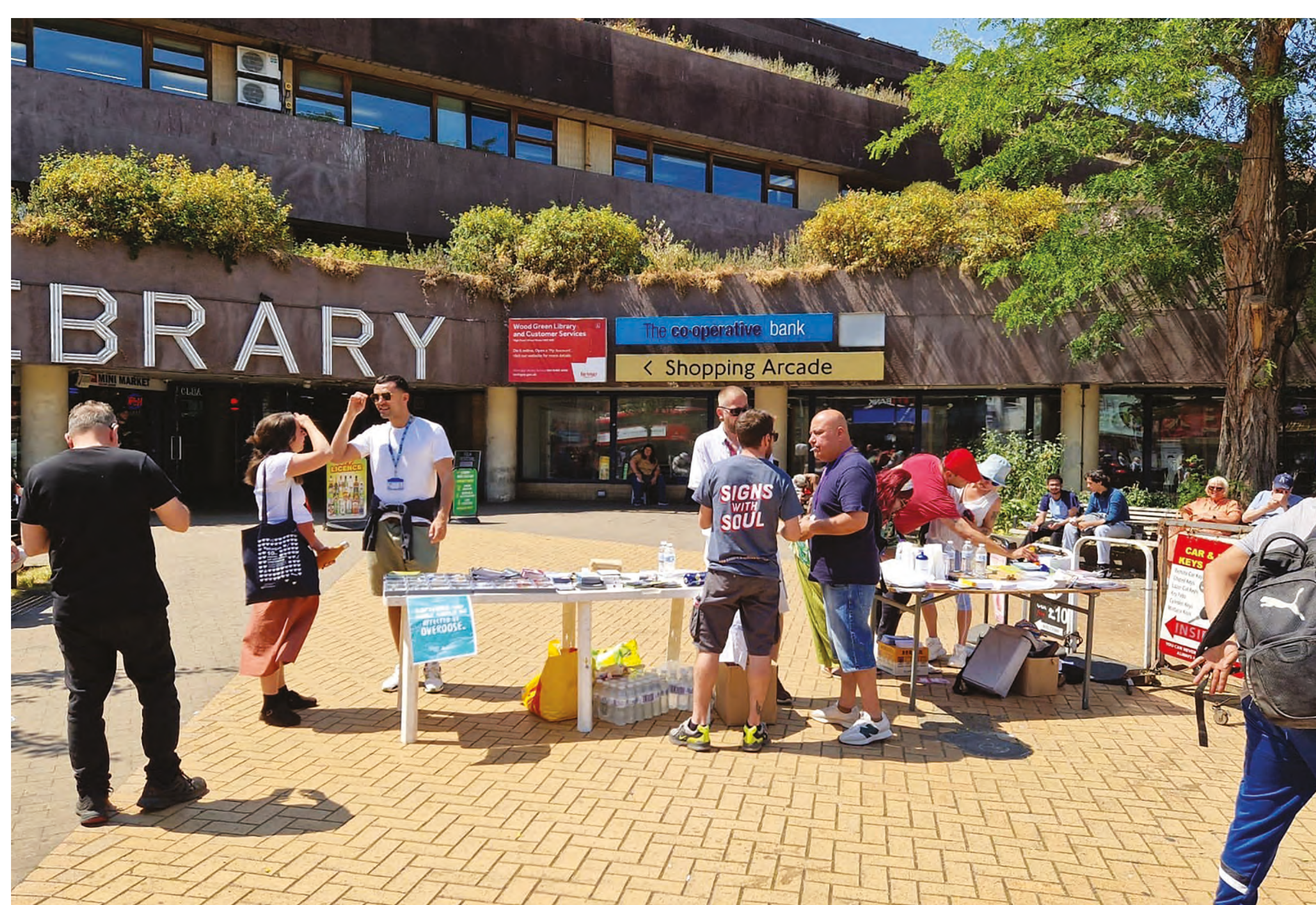
Haringey Council's Public Health team out and about this summer at an engagement event outside Wood Green Library to raise awareness about substance misuse.