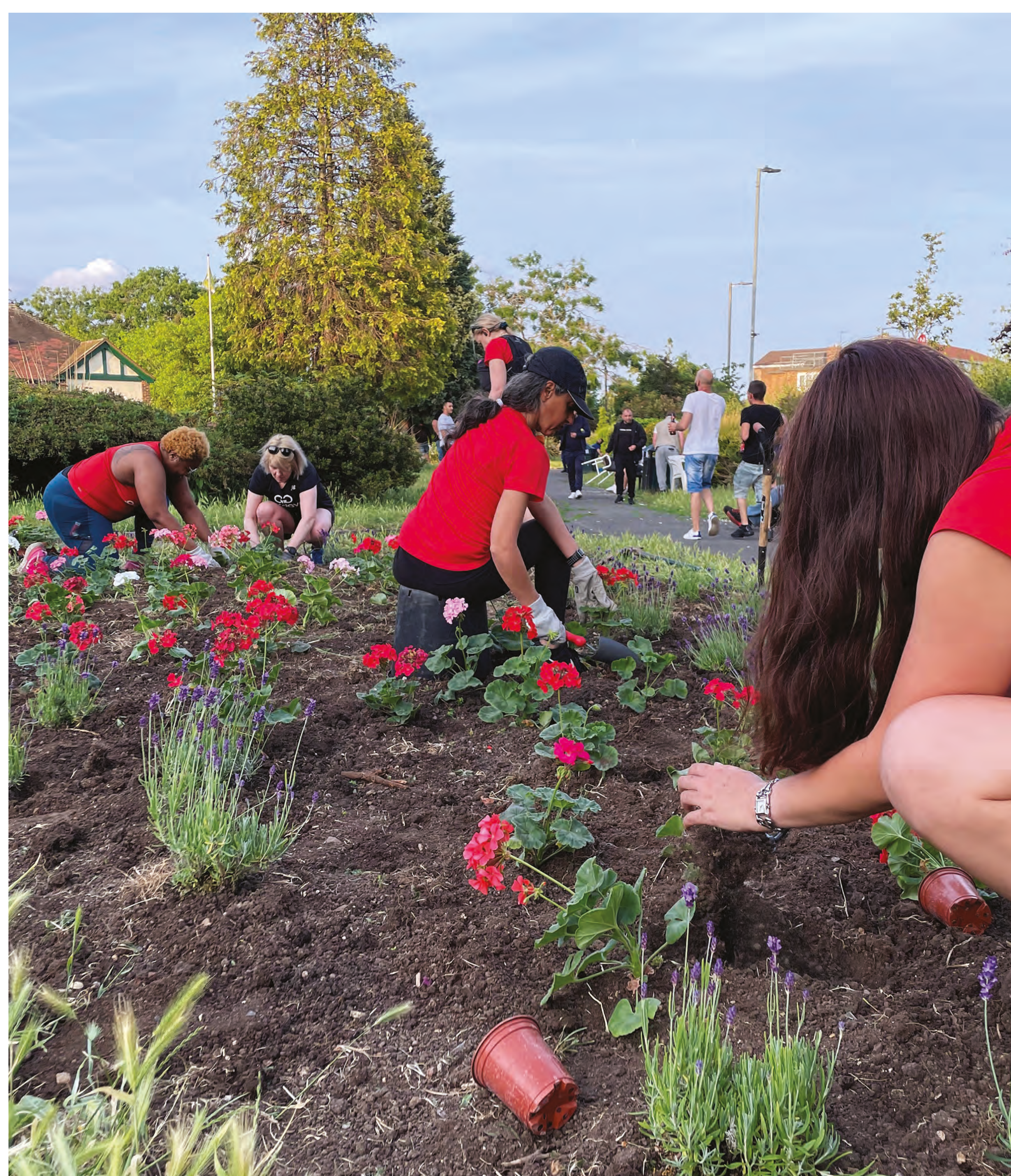
Friends of Chapmans Green have created a new flower bed at the park with the help of Good Gym Haringey and with plants provided by Haringey Council and Royal Parks.