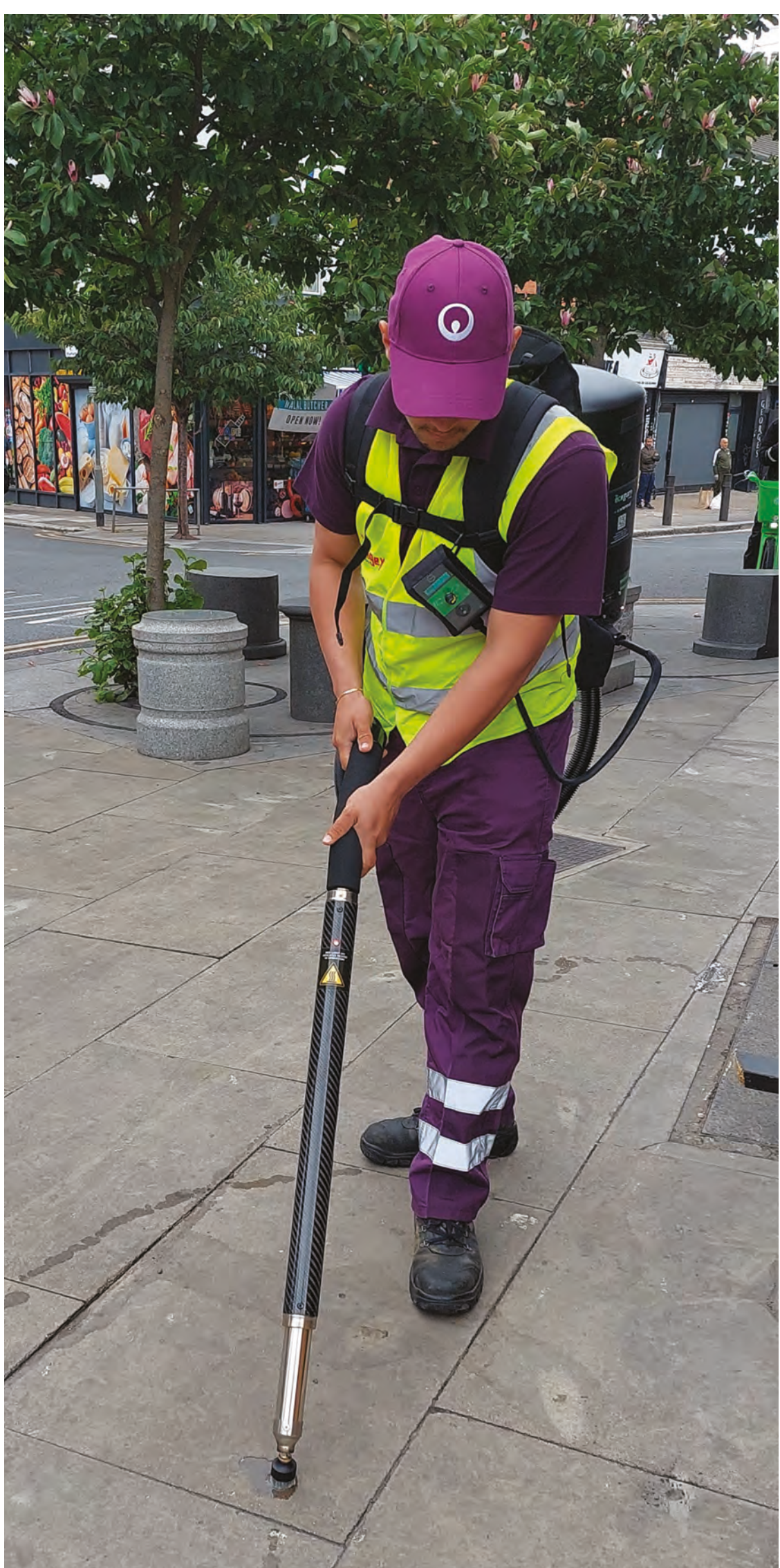
The chewing gum task force using specialist equipment to clean gum off the high street throughout Wood Green to improve the appearance of the town centre.