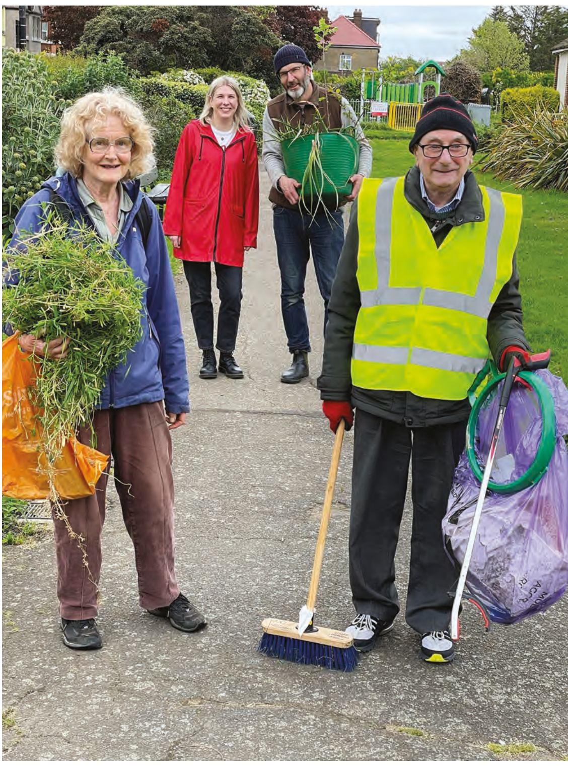
Local residents keeping Chapmans Green clean with one of their monthly litter picks.