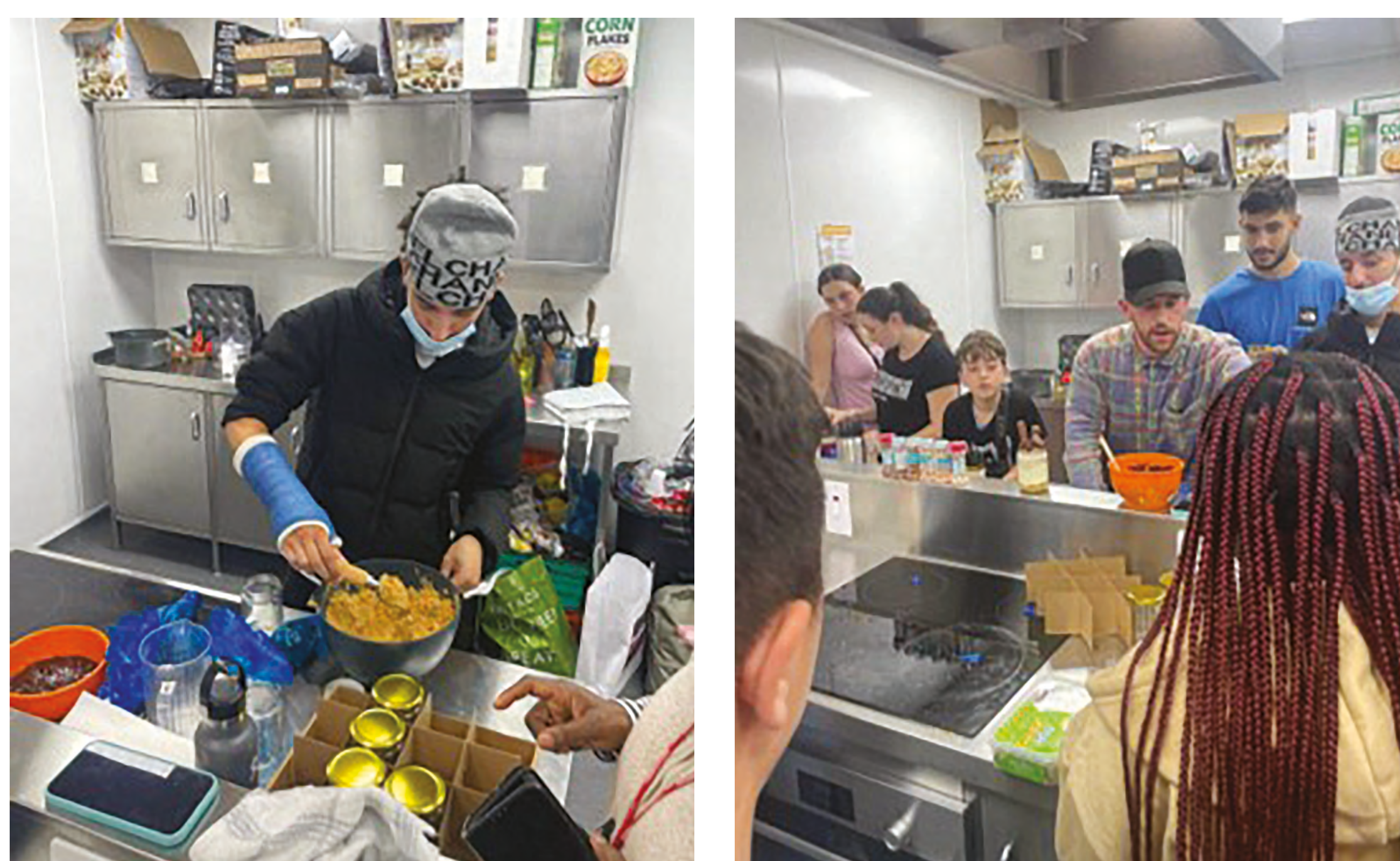
Young people taking part in cooking sessions at the purpose built training kitchen in Rising Green Youth Hub as part of the Find Your Flare 12-week entrepreneurial program learn how to prepare food products from scratch.