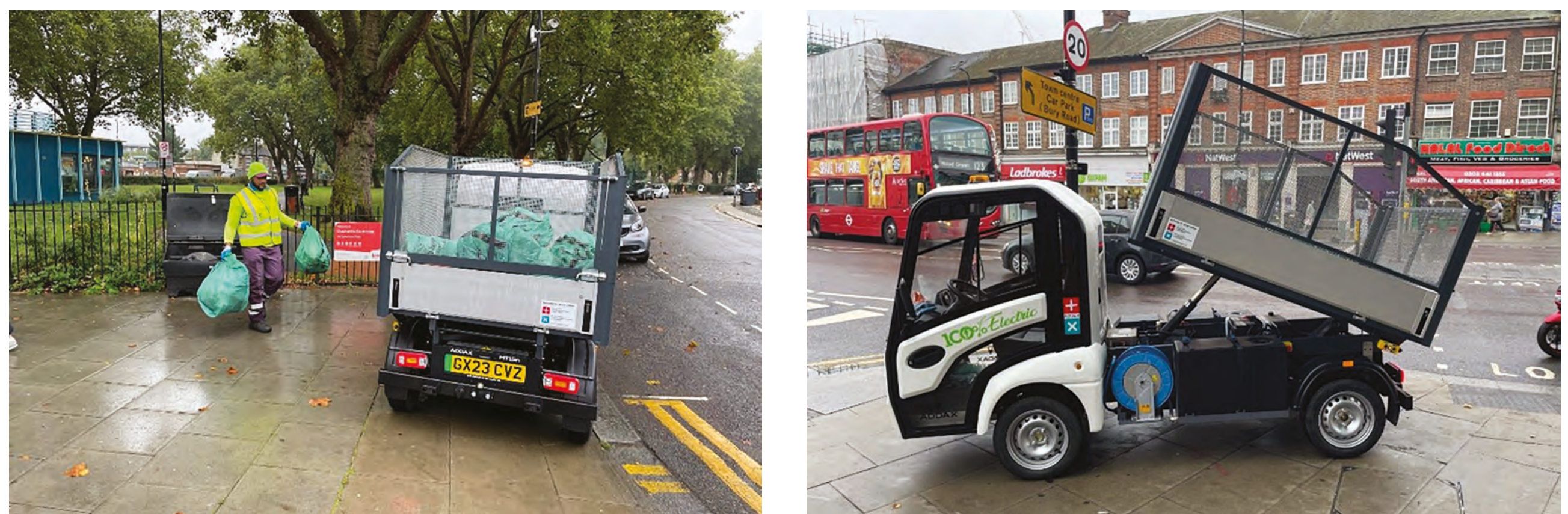
Haringey Council waste team testing out 100% electric vehicles for waste collection in Turnpike Lane.