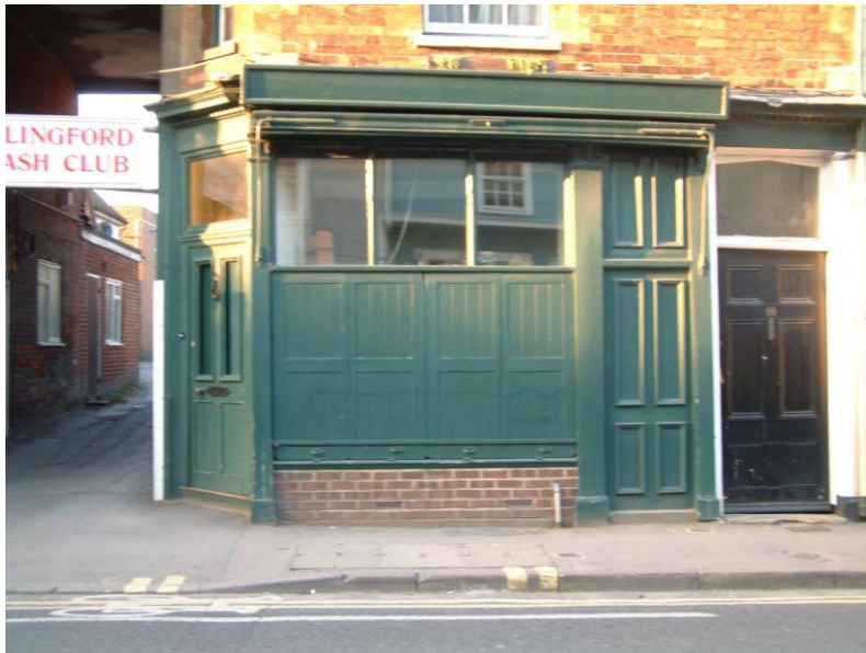
Figure 10: Traditional shutters, Wallingford, Oxfordshire