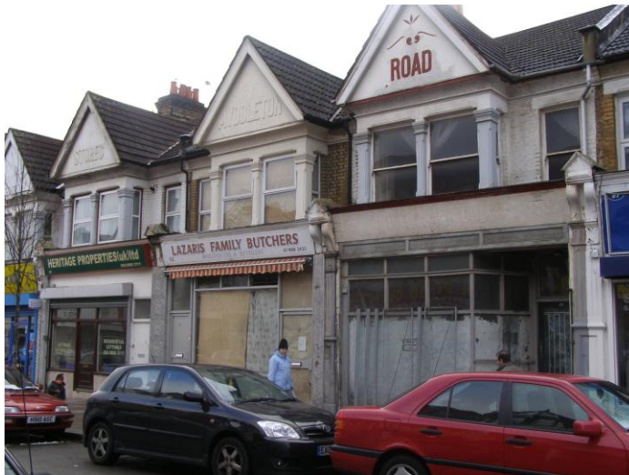
Figure 4: 91-95 Myddleton Road today, south-side