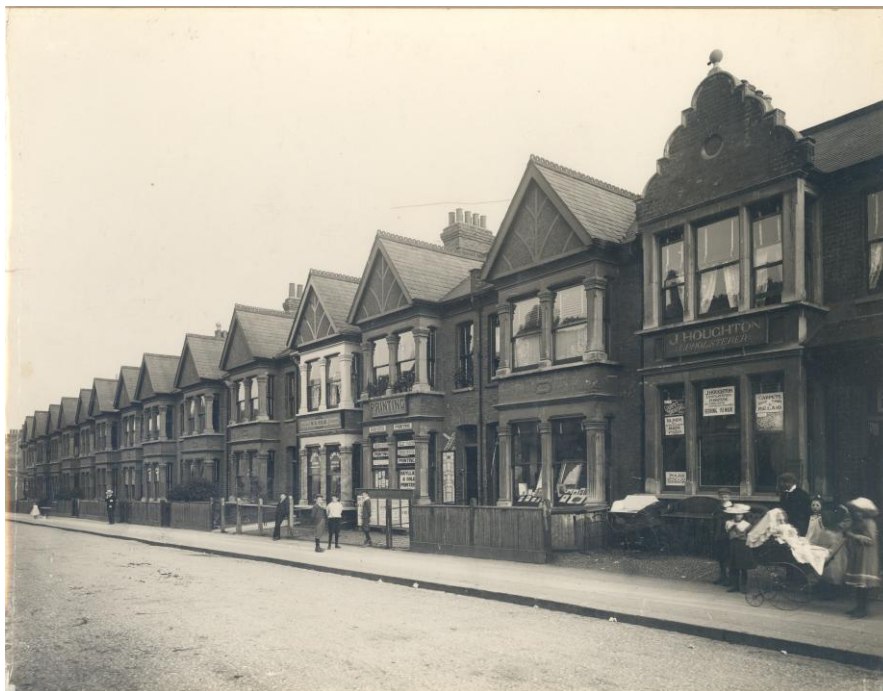
Figure 1: Terrace on south-side of Myddleton Road, circa. 1899