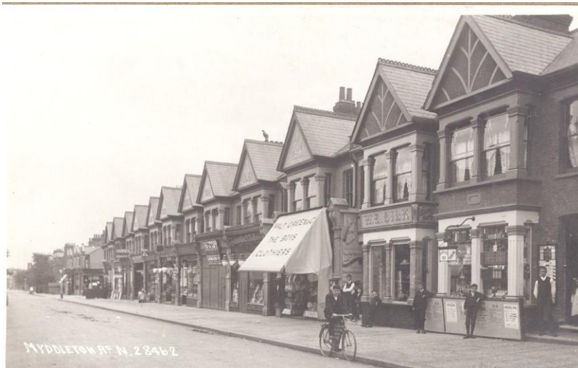
Figure 2: Terrace on south-side of Myddleton Road, circa. 1902

semi-private enclosed garden as can be seen in Fig. 1. Rooms at street level on the ground floor were occupied with basic shop units and converted to shopfront by the early 20 th century on the south-side of the street, nos. 69-109. The original front fenced gardens disappeared allowing the street to assume a more commercial appearance.