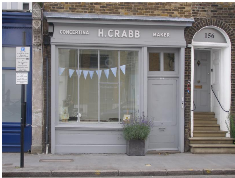
Figure 8: Zone Behind Shop Window – a Place for Art. A shop converted to residential, with a small space for art, Islington