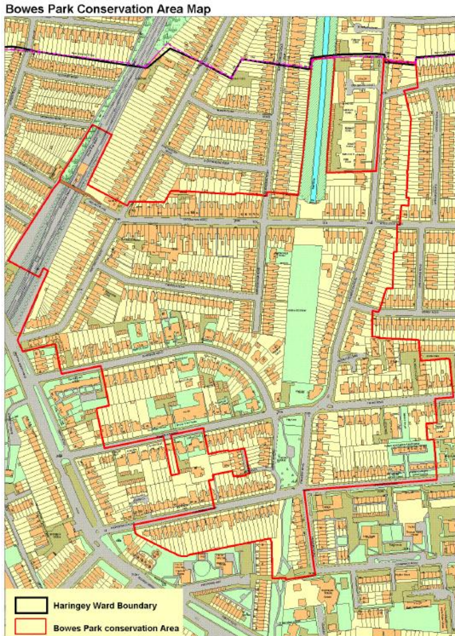
Figure 6: Map of Bowes Park Conservation Area