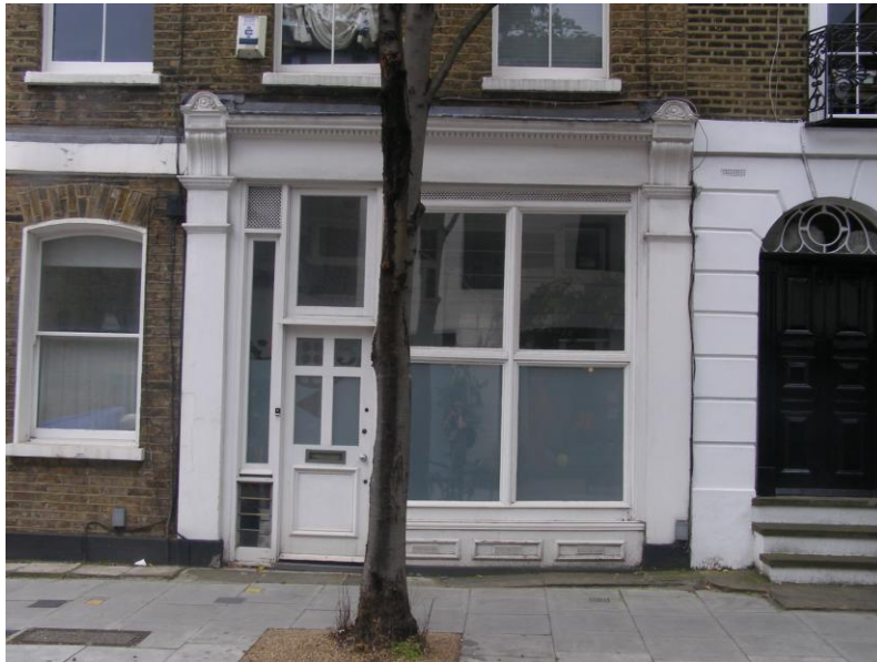
Figure 9: Wintergarden behind retained shopfront – a shop converted to residential, with wintergarden and obscured glass, Islington