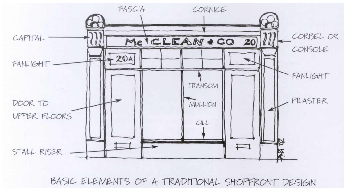
Figure 7: Basic elements of a traditional shopfront