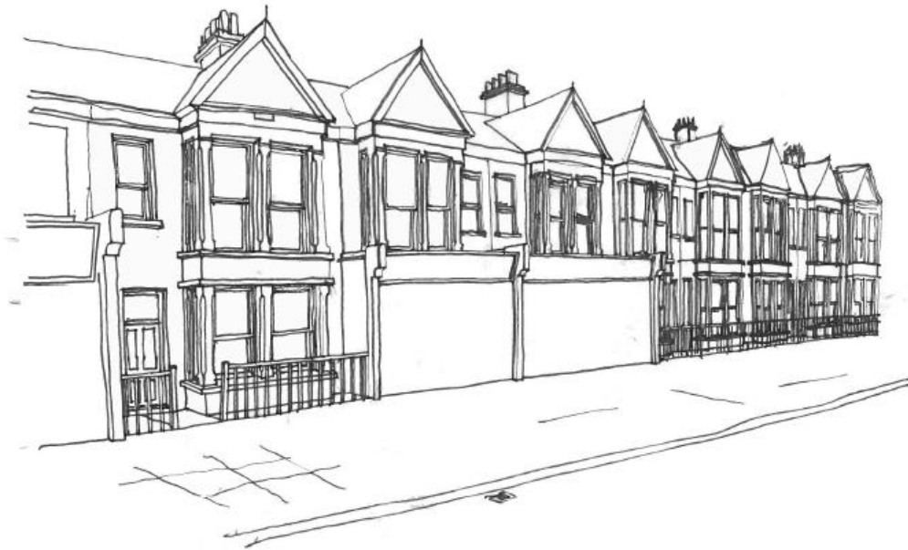
Figure 12: Terrace in transition from added on retail to return to residential

5.2.22 Fig. 12 below demonstrates the design tension of some properties converted to residential, with some plots still having shop units.