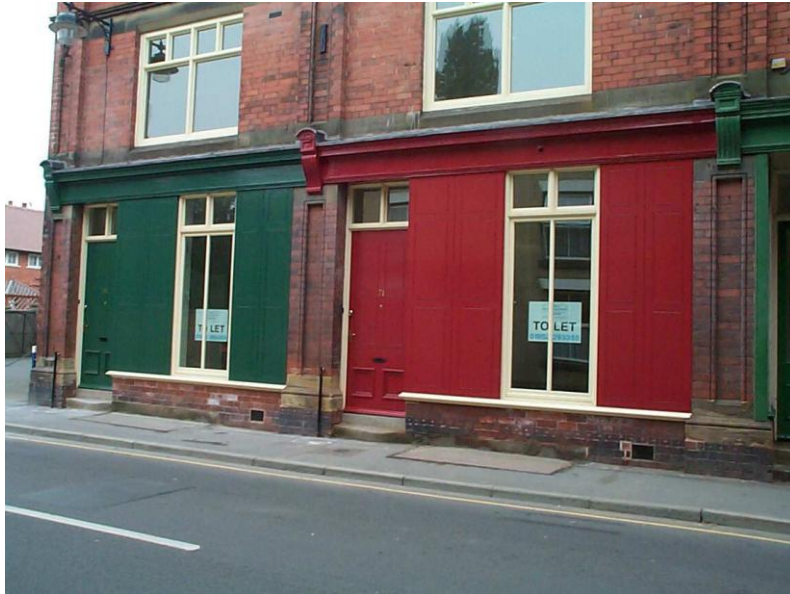
Figure 11: A shopfront converted to residential – solid panels that look like traditional external shopfront shutters, Wem, Herefordshire