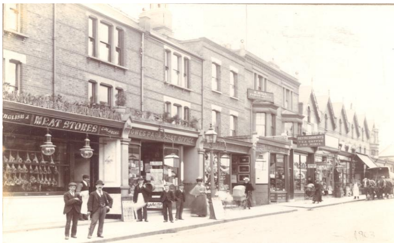
Figure 3: Terrace on south-side of Myddleton Road, circa. 1903

2.1.6 By the beginning of the twentieth century, the fabric of the street had altered significantly with a number of purpose-built shopfronts extending out onto the street, evident in the rest of the street. Over time, the development of retail in Myddleton Road has created the commercial characteristics of the local shopping centre that exists today. The extension of the electric tramline through to Bowes Park had encouraged further growth in the area and by 1912 there were 80 shops in existence.