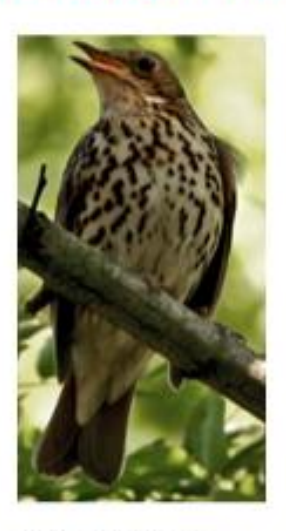
Song Thrush breeding on Pinkham Way