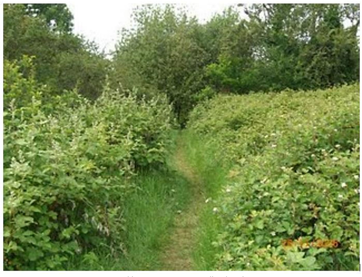
Pinkham Way site – woodland path