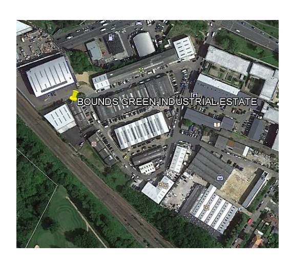
Bounds Green industrial estate

5.3 PWA considers that such an unprecedented approach to the protection of a SINC of this significance should require a clear and special justification. No such justification has ever been made out by the Council nor has it ever been argued by the Council that the nature conservation value of the site is materially less